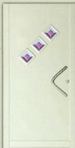
R - 12