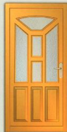
R - 97