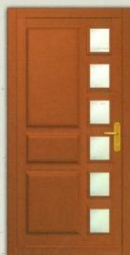
R - 107