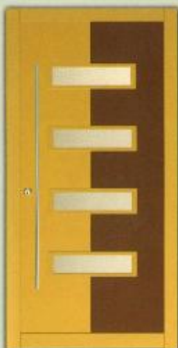
R - 11