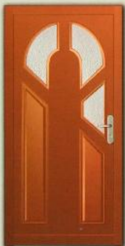
R - 53