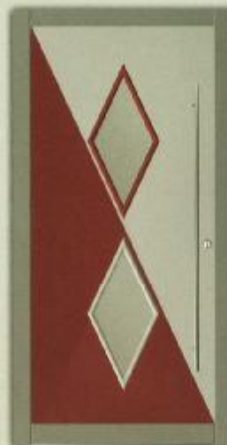
R - 18