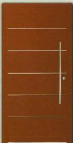
R - 10