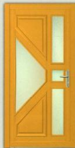
R - 96