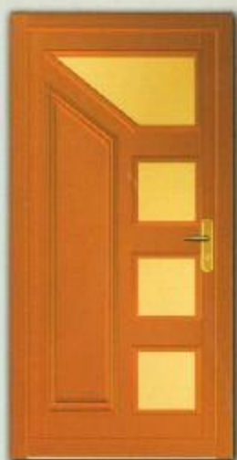
R - 94