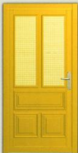
R - 102