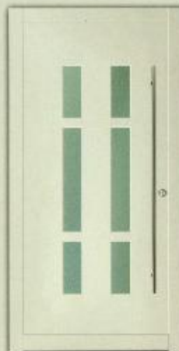
R - 17