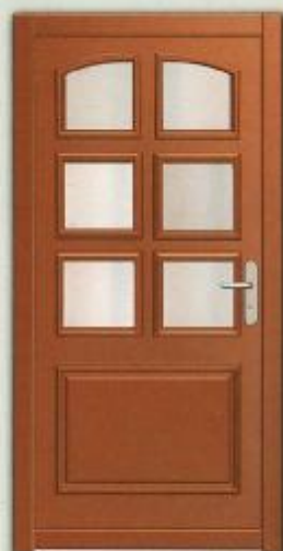
R - 106