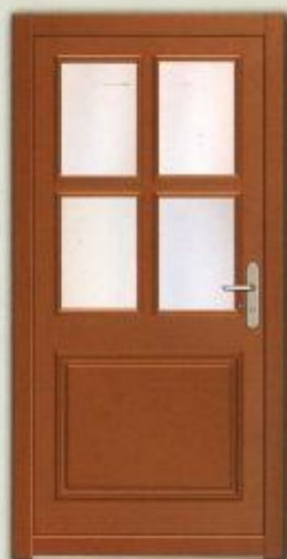
R - 101