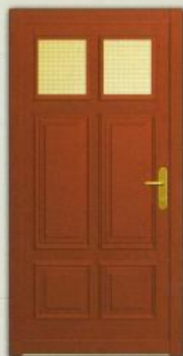
R - 103