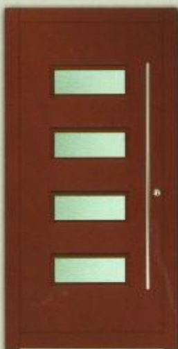
R - 15