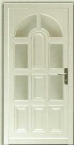
R - 54