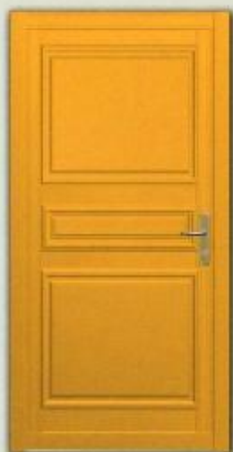
R - 100