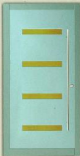
R - 16