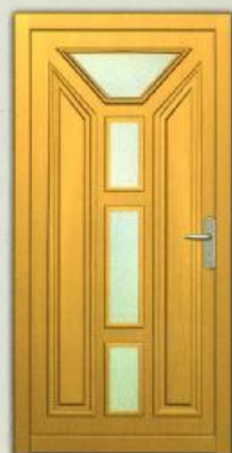
R - 98