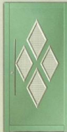
R - 19