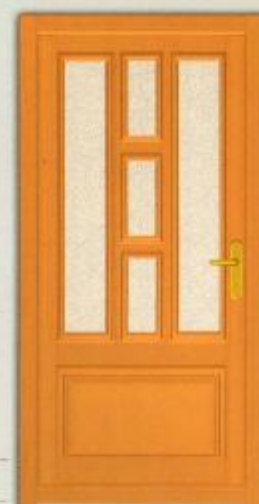
R - 108