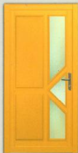
R - 95