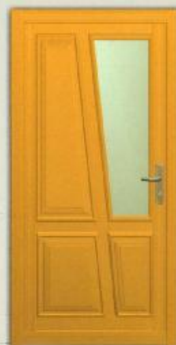
R - 93