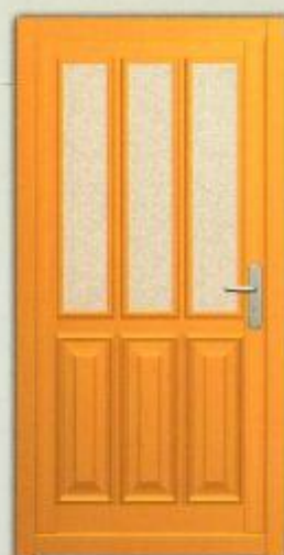
R - 104