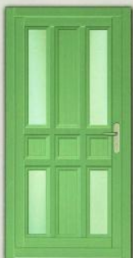
R - 105